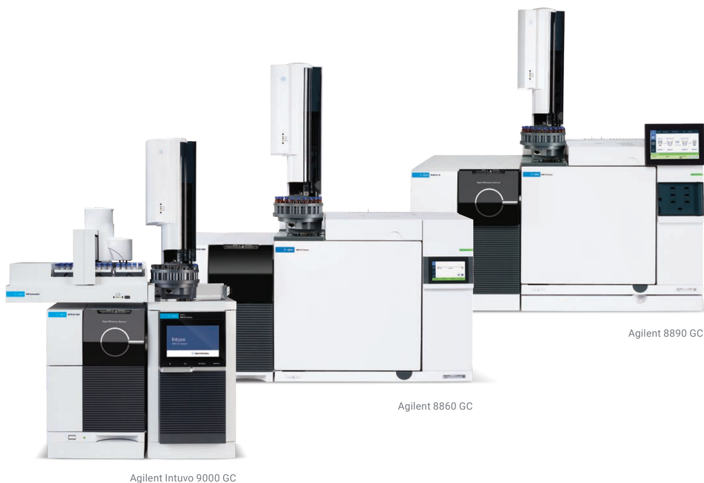
Agilent Intuvo 9000 GC

You can't go wrong with a GC/MS instrument from Agilent. We start with the world's most trusted gas chromatographs. Our latest models are super smart: they tell you when to change a column, let you know if there's a leak, and collect system information to help you be more productive. Then we pair those GCs with quadrupole, triple quadrupole, and time-of-flight mass spectrometers—so you can choose the technique that best suits your needs. Whether you're doing routine testing or cutting-edge research, we have a system for that. And we have lots of ways to accelerate your turnaround time.