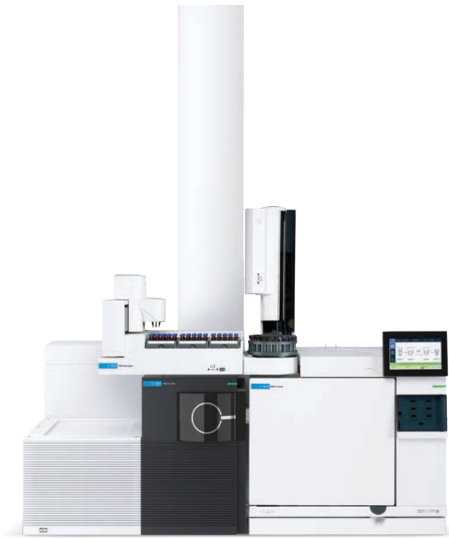
Agilent 7250 GC/Q-TOF system