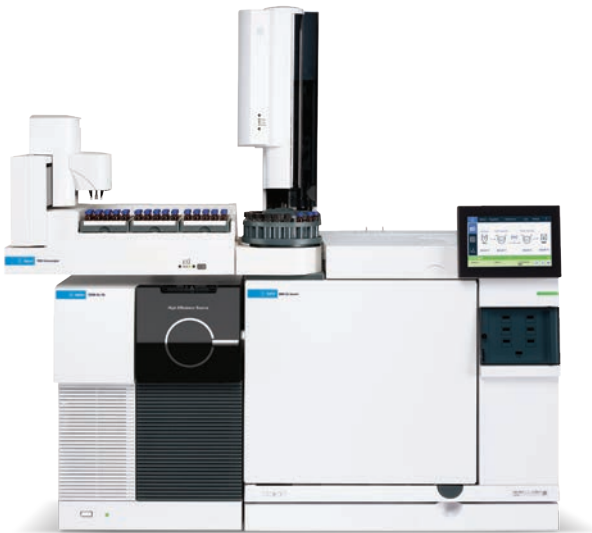
Agilent 7010B triple quadrupole GC/MS system

Identify unknown compounds and uncover additional data using the unique capabilities of our quadrupole time-of-flight GC/MS system, with its low energy capable electron ionization (EI) source. This revolutionary all-in-one system is ideal for performing complex metabolomics studies, screening for pesticides in challenging matrices, identifying analytes in herbal extracts, monitoring contaminant levels in fuel, and more.