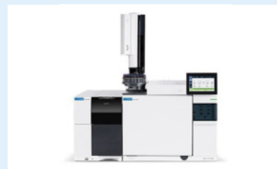
GC/MS Systems (product pictured: 8890 GC System coupled to a 5977B MS)

This is an award-winning, lab-based instrument that provides complete particle characterization including particle size, area, number, and other surface characteristics. It is much faster in particle analysis and also has a larger imaging area than FTIR. In addition to the benefits of the handheld FTIR, this model has a minimum detection range between 10 and 20 \mu\text{m} .