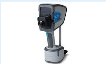
FTIR (product pictured: 4300 Handheld FTIR)

Agilent Technologies provides a range of tools for such analysis and detection, including: