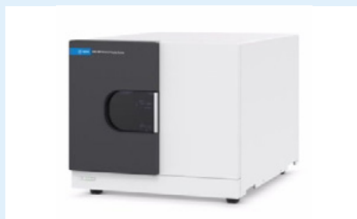
LDIR Chemical Imaging (product pictured: 8700 LDIR Imaging System)

This is a portable in-field device, which is effective in quick particle counting and size measurement of larger microplastics up to around 100 \mu\text{m} .