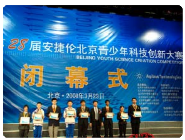
In March 2008, Agilent title sponsored Beijing Youth Science Creation Competition for the second consecutive year.