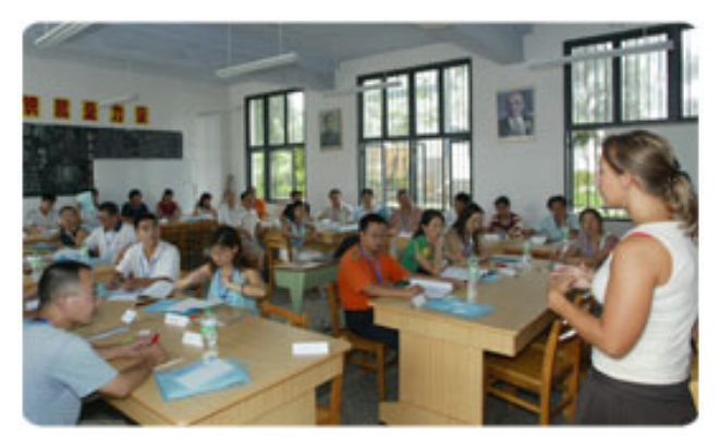
In Aug, 2007 Agilent and TWB conducted communication classes for school teachers in Du Jiang Yan and Chengdu, in Sichuan Province. More than 156 local schools and 220 English and science teachers attended the workshops

Agilent China has long partnered with local government and organizations to support community efforts in science and environmental education. Since 1999, Agilent has partnered with the China Youth Volunteer Association to sponsor approximately 3000 university volunteer graduates that teach mathematics and science in remote, poverty-stricken areas before they begin their post-graduate study. Agilent also works jointly with Teacher Without Borders (TWB) – an international non-profit organization — and launched a program in 2006 in Chengdu, Sichuan province that brings advanced science teaching methodology to local teachers and school principals.